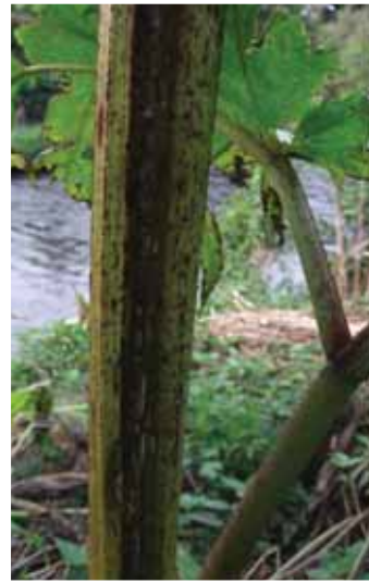
Giant hogweed stem