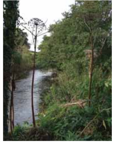
Giant hogweed – Ballinderry River - July 2009 (left) and September 2009 (right).