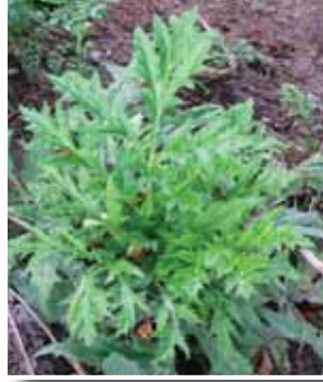
In April seedlings establish a leaf rosette