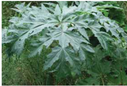
Giant hogweed leaf in July