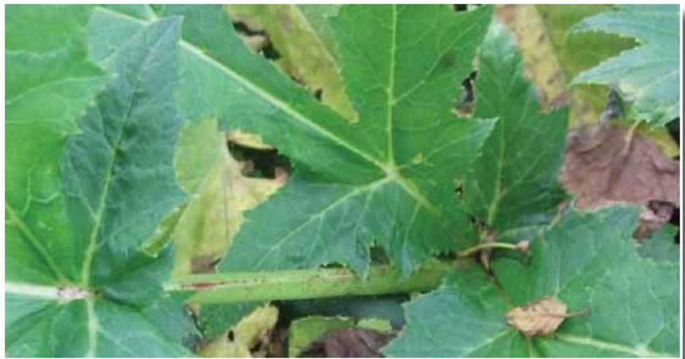
Giant hogweed leaf stalk