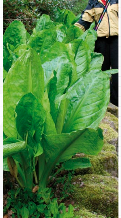
American skunk cabbage plants at almost full height - C. O' Flynn