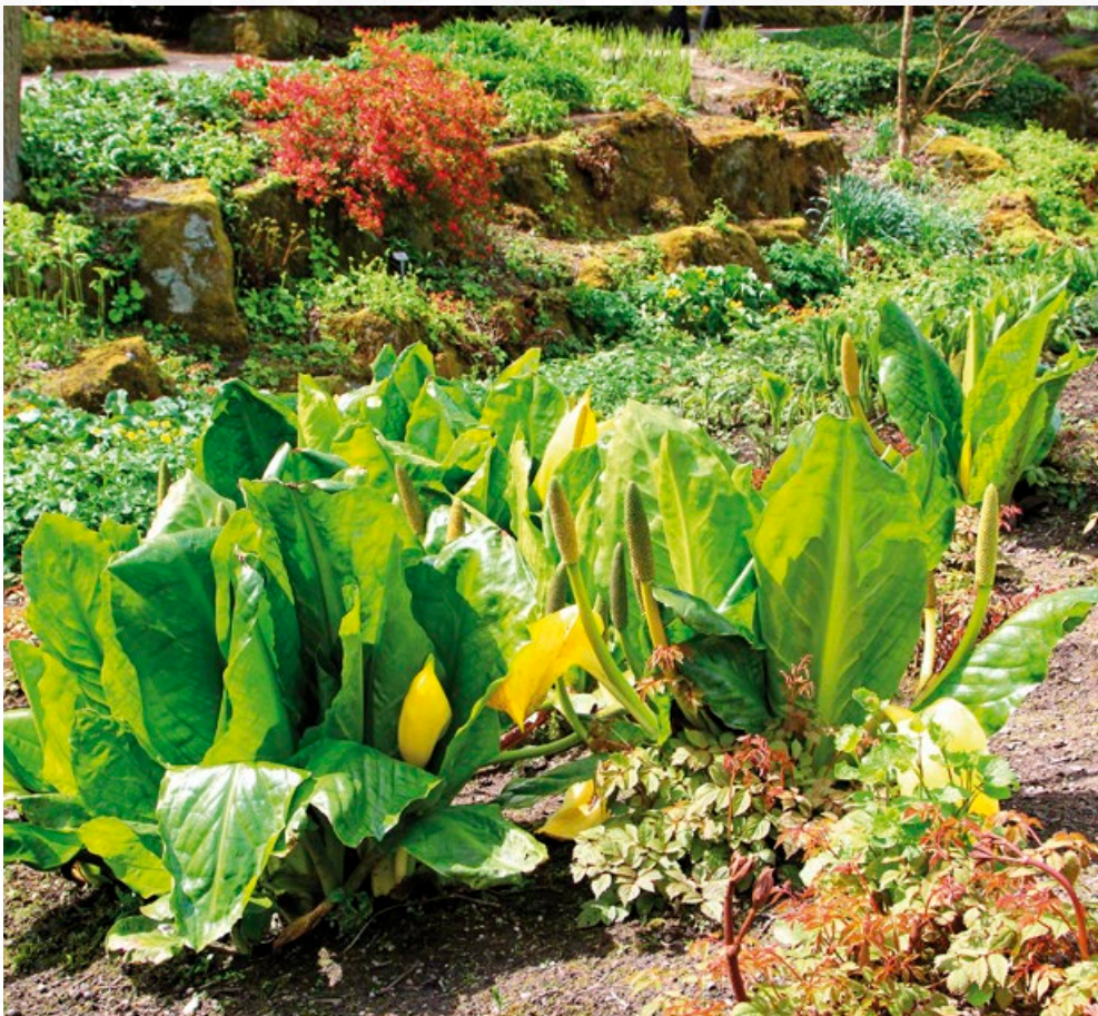
Planted American skunk cabbage, notice how the spadex outgrows the spathe which once shielded it