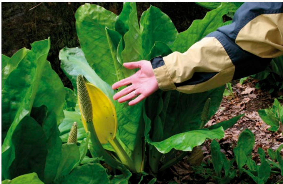
Size of American skunk cabbage spike and spadex against hand - C. O'Flynn