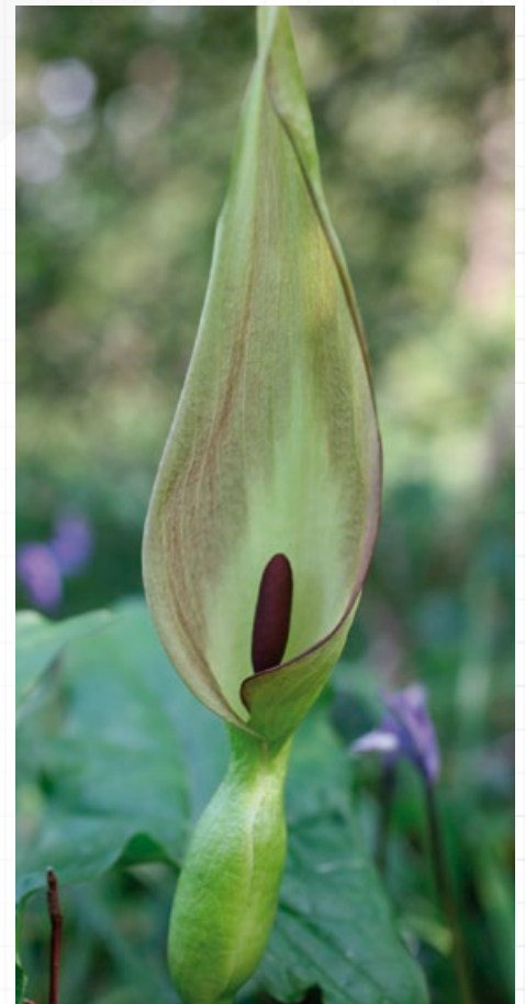
Arum maculatum is native to Ireland which has a spadex protruding from a spathe L.Lysaght