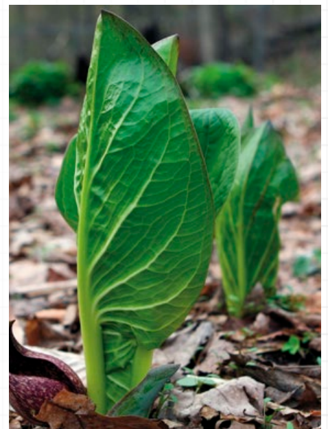
Emerging leaf of American skunk cabbage