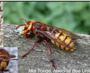
Mia Tonge, National Bee Unit